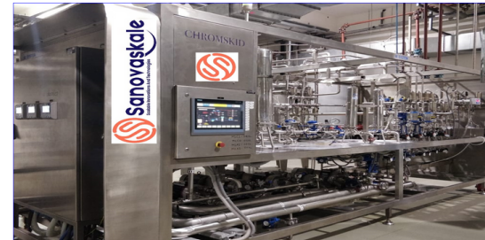
ChromScale Skid: Fully Automatic with Compliance

We supply resins for Chromatographic Separation & Purification