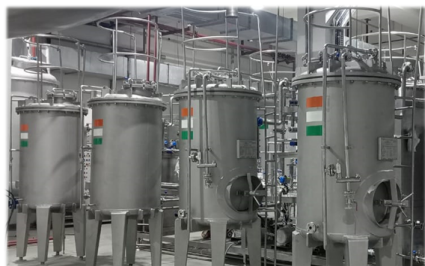
Commercial ChromScale Columns

Continuous conversion microreactors, ChromScale® Columns, ChromScale® Skids (Batch & Continuous Chromatography), SanovaFlux -MF/UF/NF/RO Process systems